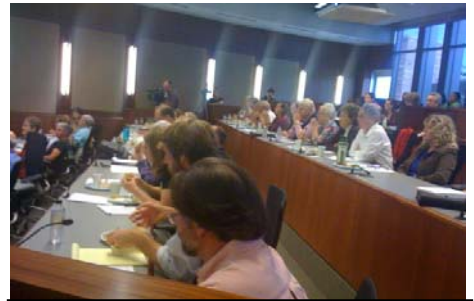
Participants listen at the Pathways Past Poverty presentation of the new poverty data at the Fort Collins Police Department.