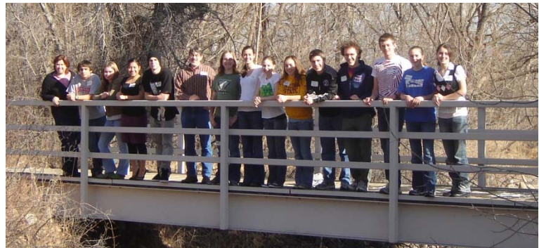
Members of the PSD Think Tank take a break from their CPD facilitation workshop at the Tamasag Retreat Center north of Fort Collins.

PSD Think Tank - The CPD continues to work with a group of PSD high school students representing five different high schools as they serve in the PSD Think Tank. Think Tank students have been often participants in CPD events, and then in February of 2008, twelve students were trained as facilitators during an all day